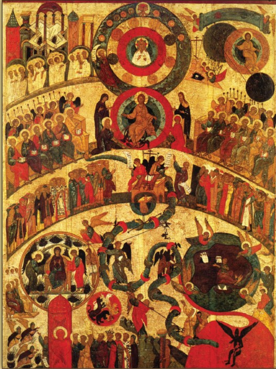
Icon of the Last Judgment