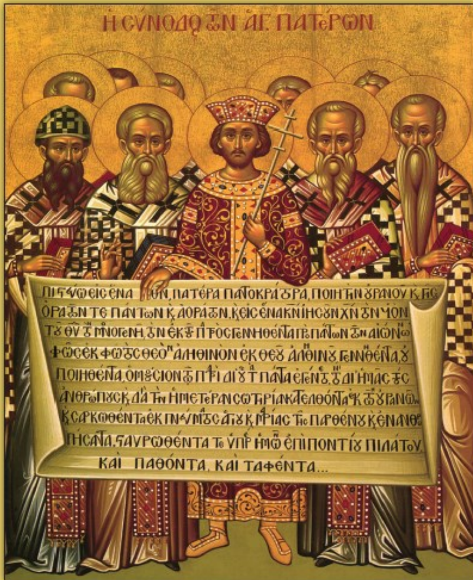
Icon of the Fathers of the First Ecumenical Council