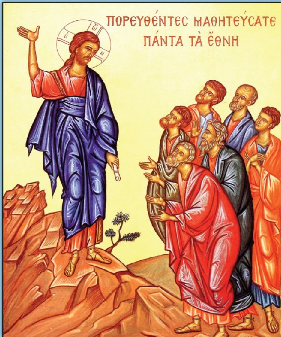
Icon of Christ Preaching to the Apostles