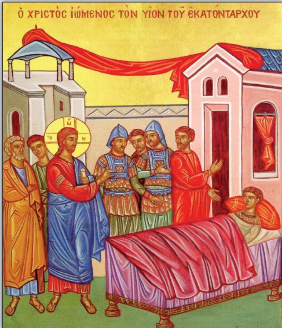
Icon of Christ Healing the Centurion's Servant