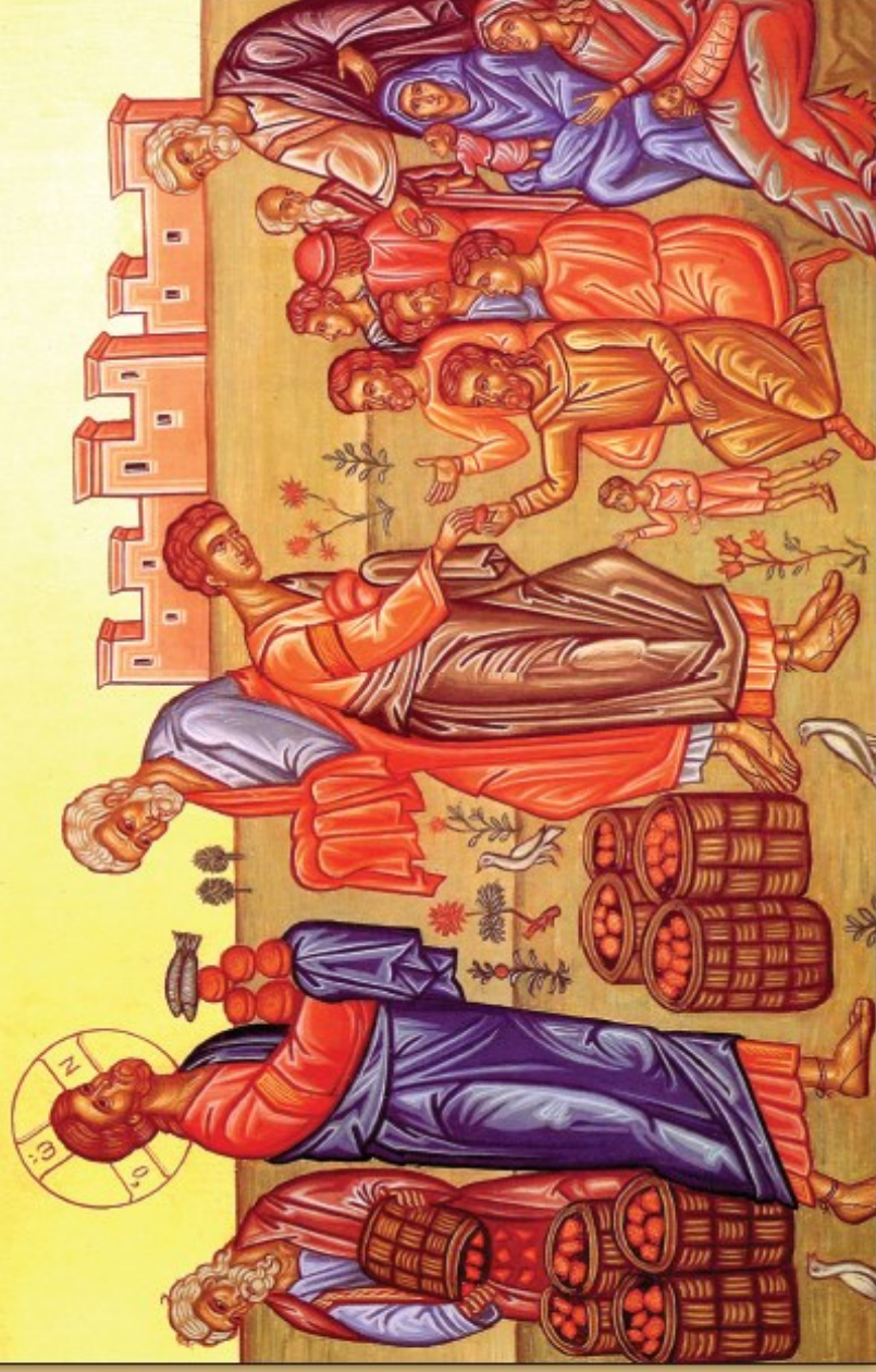
Icon of Jesus Feeding the Five Thousand

Ὁ ΧΡΙΣΤΟΣ ΕΥΛΟΓΩΝ ΤΟΥΣ ΠΕΝΤΕ ἄΡΤΟΥΣ ΚΑΙ ΤΟΥΣ ΔΥΟ ἰΧΘΥΑΣ