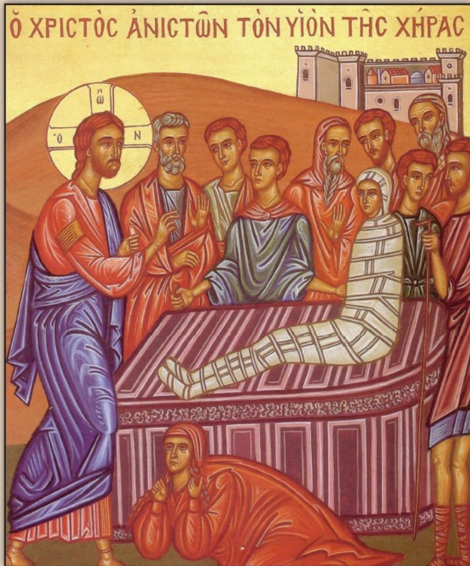
Icon of Christ Raising the Widow's Son