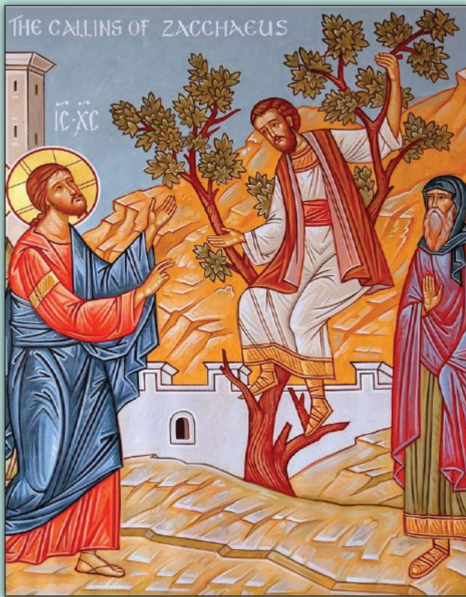
Icon of Christ and Zacchaeus (Luke 19:1-10)