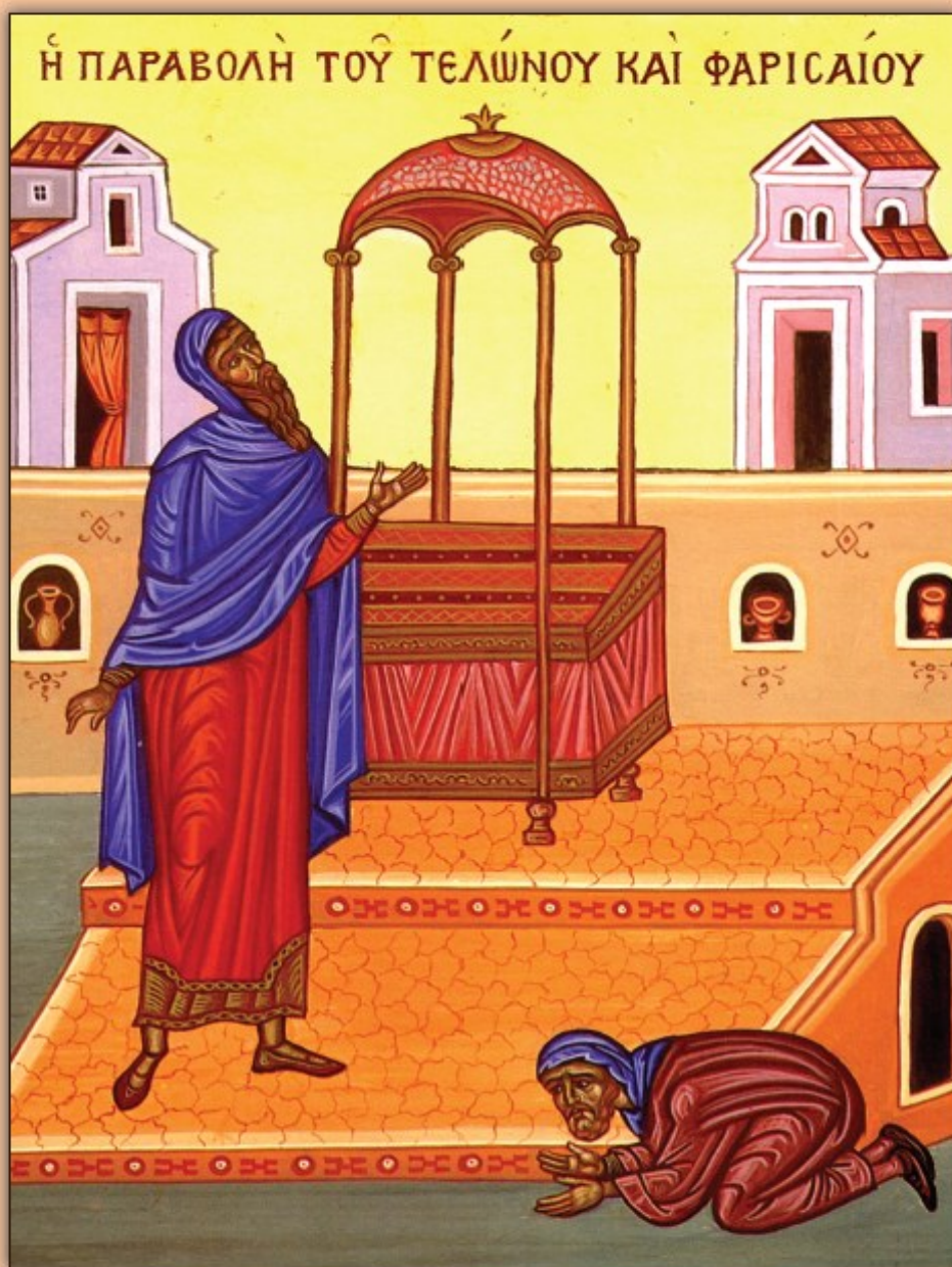
Icon of the Publican and Pharisee (Luke 18:10-14)