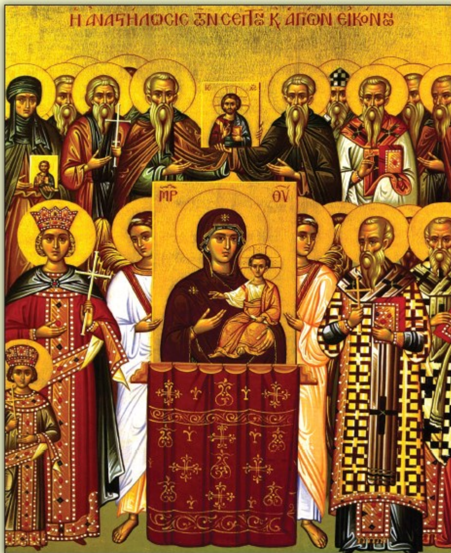
Icon of the Restoration of Holy Images