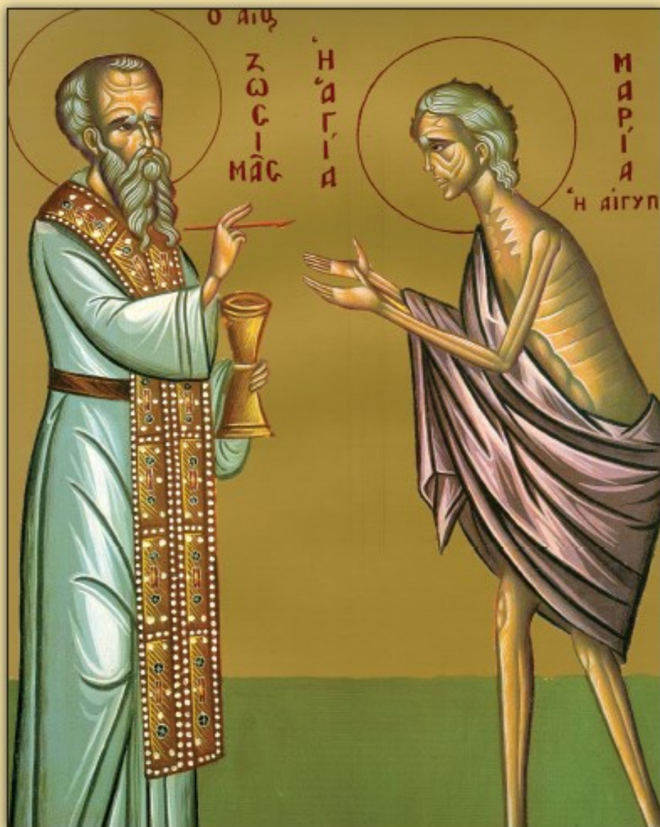
Icon of Saints Zozimos and Mary of Egypt