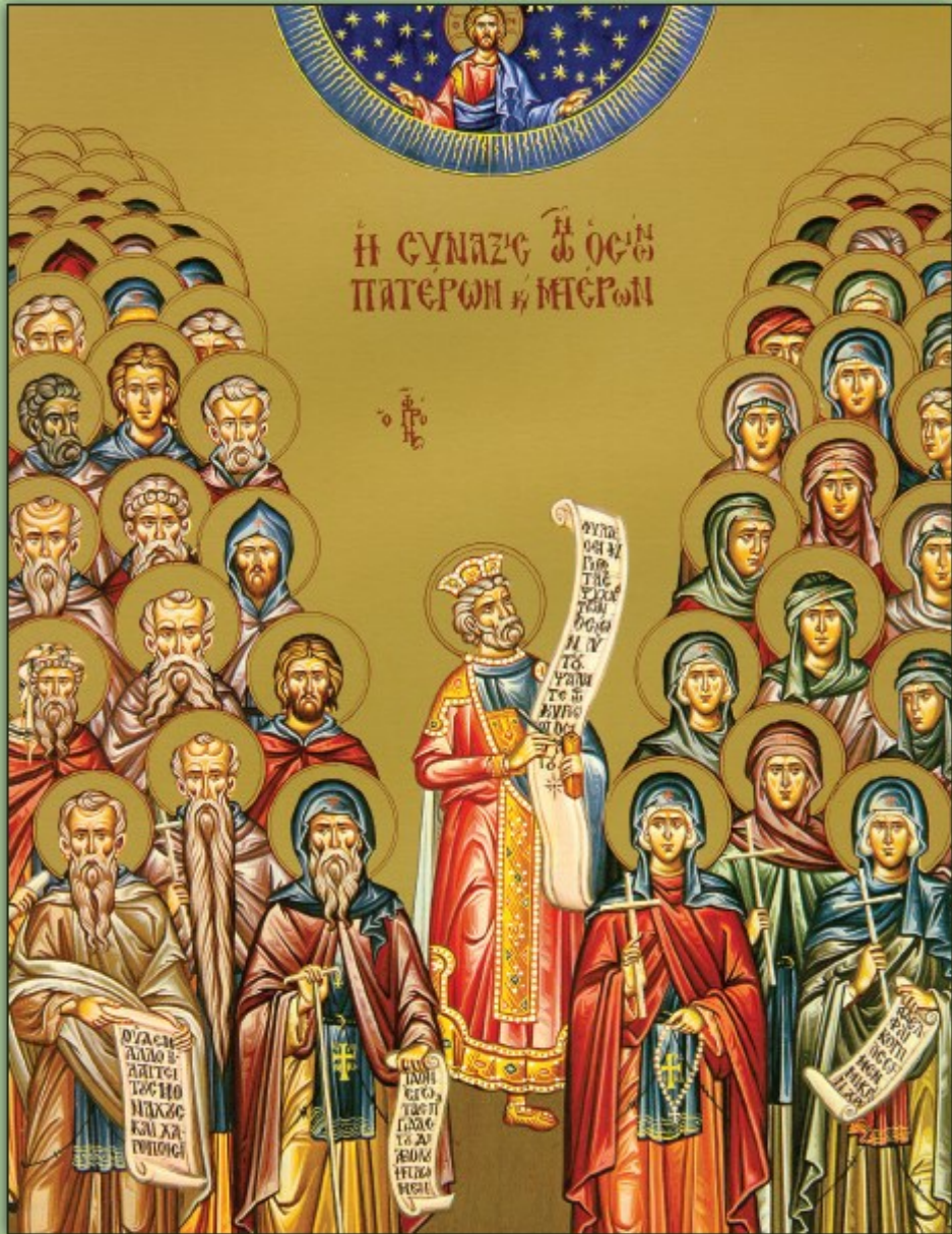
Icon of the Holy Ancestors